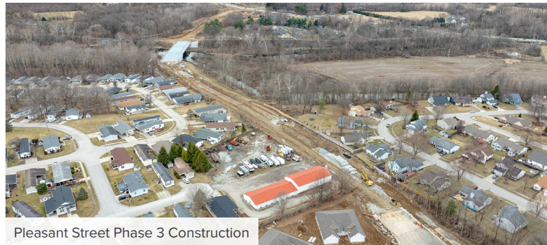
Pleasant Street Phase 3 Construction