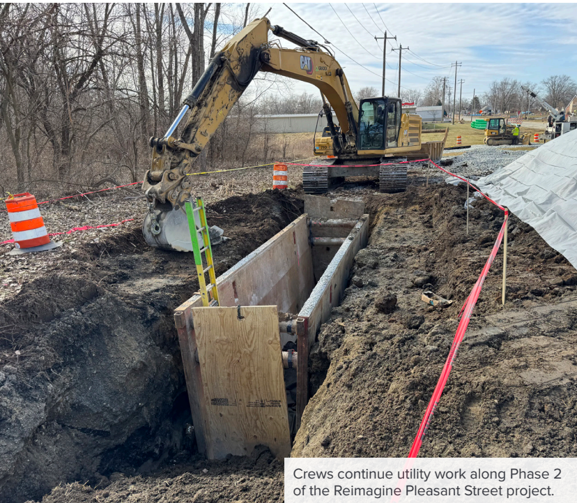
Crews continue utility work along Phase 2 of the Reimagine Pleasant Street project.