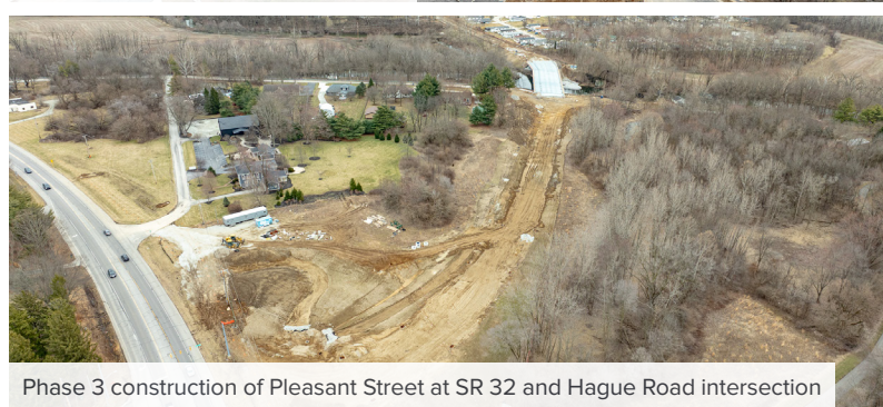
Phase 3 construction of Pleasant Street at SR 32 and Hague Road intersection