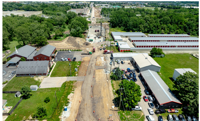
Phase 2 construction continues with crews continuing ground improvement work.

Ground improvement work continues as part of Phase 2 construction along Pleasant Street between 13th and 16th streets. This work will allow the new Pleasant Street to be raised, which will reduce the risk of flooding in the area. When complete, Pleasant Street will become an emergency access route, making Noblesville a safer, more resilient community.