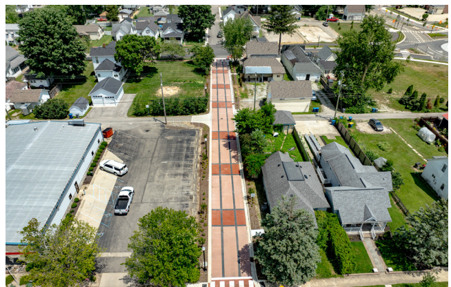
Decorative finishes are being added along Walnut Street as part of the Reimagine Pleasant Street project.