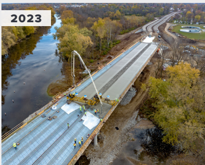
WHITE RIVER BRIDGE

As 2024 comes to an end, check out these photos to see examples of the progress made over the past year.